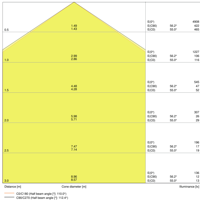
LDC typ cone