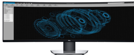
DELL ULTRASHARP 34 CURVED USB-C HUB MONITOR | U3421WE

Optimize your conference calls, multimedia streaming and gaming with this 5W RMS Microsoft ® Skype ® for Business certified soundbar.