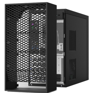
PRECISION MINI-TOWER CABLE COVER

Productivity never looked so good. Archive more with this immersive 34" curved monitor with wide color coverage and extensive connectivity including RJ45, USB-C and quick access front ports.