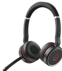
JABRA EVOLVE 75

Safeguard your identity and login instantly without needing to remember complex passwords when you use the Dell Wired Mouse with Fingerprint Reader.