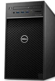
PRECISION MINI-TOWER DUST FILTER

Experience captivating details and true-to-life color reproduction on this brilliant 27" 4K monitor with the widest color coverage in its class ® .