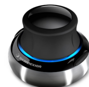
3DCONNEXION ® SPACEMOUSE WIRELESS

With the ambient noise cancellation feature of this wireless headset you can hear every word clearly on your next call.