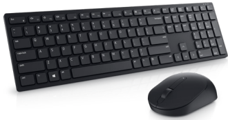
DELL PREMIER WIRELESS KEYBOARD AND MOUSE | KM5221W

Enhance productivity with a comfortable keyboard and a mouse that can scroll on almost any surface (including glass and high gloss). Dual mode connectivity (Bluetooth and USB receiver) allows you to pair up to 3 devices.