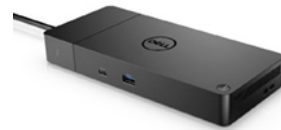
Dell Thunderbolt 4 Dock - WD22TB4

Work from anywhere with this Bluetooth Teams certified headset that lets you switch seamlessly to your PC or smartphone and enjoy crystal clear audio on the go.