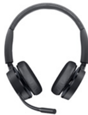
Dell Pro Wireless Headset - WL5022

Large Single Display with USB Hub for increased productivity and reduce home office clutter.