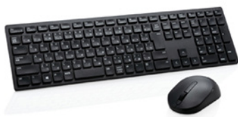
Dell Pro Wireless Keyboard and Mouse - KM5221W

Connect all monitors and peripherals into one device and deliver lightning fast charging with thunderbolt connectivity.