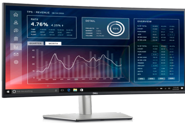
UltraSharp 34 Curved Monitor USB-C Hub - U3423WE

Large Single Display with USB Hub for increased productivity and reduce home office clutter.