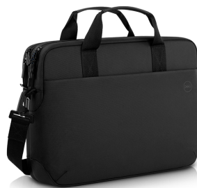
Dell EcoLoop Pro Briefcase - CC5623

Get productive with a quiet, full-size keyboard and mouse combo with programmable shortcuts and 36 months battery life.