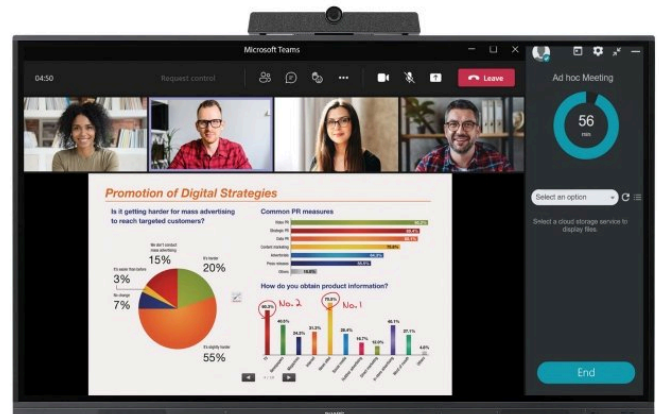
* AV Soundbar PN-ZCMS1 optional