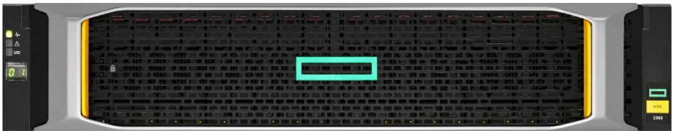
HPE MSA 2060 Storage

The HPE MSA 2060 is a flash-ready hybrid storage system designed to deliver hands-free, affordable application acceleration for small and remote office deployments. Don't let the low cost fool you. It gives you the combination of simplicity, flexibility, and advanced features you may not expect in an entry-priced array. Start small and scale as needed with any combination of solid state drives (SSDs), high-performance Enterprise SAS HDDs, or lower-cost Midline SAS HDDs. With the ability to deliver 325,000 IOPS, the new MSA 2060 is up to 45% faster than its prior generation with ample horsepower for even the most demanding workloads.