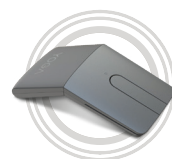
Lenovo Yoga Mouse with Laser Presenter