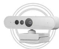
Lenovo 510 FHD Webcam