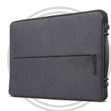
Lenovo Urban Sleeve Case