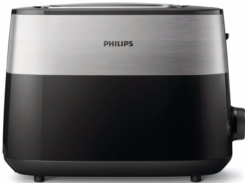
Philips Daily Collection Toaster