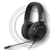
Lenovo IdeaPad Gaming H100 Headset