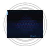
Lenovo IdeaPad Gaming Cloth Mousepad (M & L)*

* Example of Lenovo catalogue naming convention