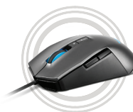
Lenovo IdeaPad Gaming M100 RGB Mouse