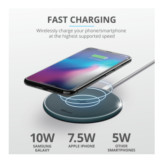
PRODUCT PICTORIAL 2