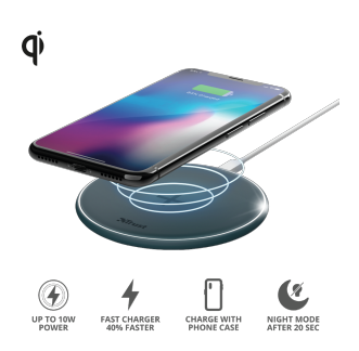
PRODUCT ESHOT 1