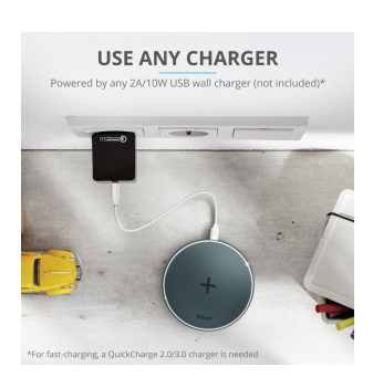
PRODUCT PICTORIAL 4