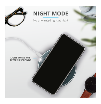
PRODUCT PICTORIAL 3