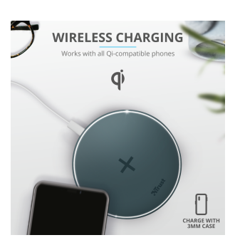
PRODUCT PICTORIAL 1