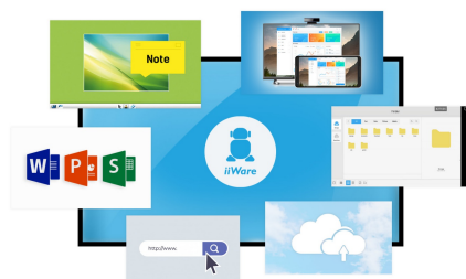
iiWare 8.0 (Android OS)

Share, stream and edit content from any device directly on screen and transform your team meetings or lessons into an easy, fast and seamless interactive session with the included WiFi module ( OWM001 ) and the ScreenSharePro app.