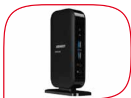
dynadock V3.0, PA5082E-1PRP