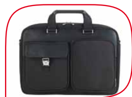
Premium Laptop Case 40.6cm (16''), PX1787E-1NCA