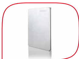
STOR.E SLIM 2.5 500GB USB 3.0 silver, HDTD105ES3D1