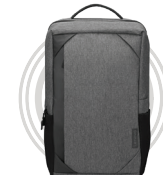
Lenovo 15.6" Laptop Urban Backpack B530