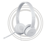
Lenovo 110 USB Stereo Headset

* Example of Lenovo catalog naming convention