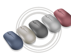
Lenovo 530 Wireless Mouse